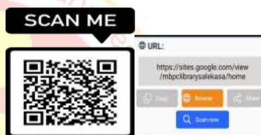
Scan QR Code of library Google site.

Following information are available in Google site.- library update ,e journal ,e books, question paper & study material. library guide ,full text databases, download article file, ask a librarian sms service, for library exhibition