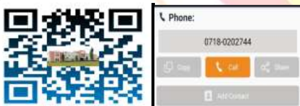
Scan the QR Code For Library Contact

Due to curiosity of how to functioning of QR Code, researcher create library email QR code in which student scan this QR& get email id of library. Firstly Select QR code generator website then various options are available, select one of them and crate .with the help of e mail facility students contact to library department. This technology works as library guide to students.